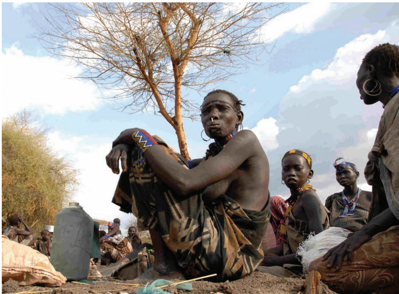
▲ Displaced Murle rest after attacks by Lou Nuer drove them from home in Pibor County, Jonglei, 21 March 2009.

the 2008 campaign had very little impact on the internal security dynamics within Southern Sudan. There were instances of abuse committed under the auspices of civilian disarmament, but the effort did not lead to violence on the scale of the 2005–06 campaign. Indeed, its implementation was relatively peaceful, though largely due to its cautious and patchy implementation, not as a result of a fundamental change of strategy on the part of the GoSS. All indications are that the government plans to continue civilian disarmament in 2009, by force if necessary. 82