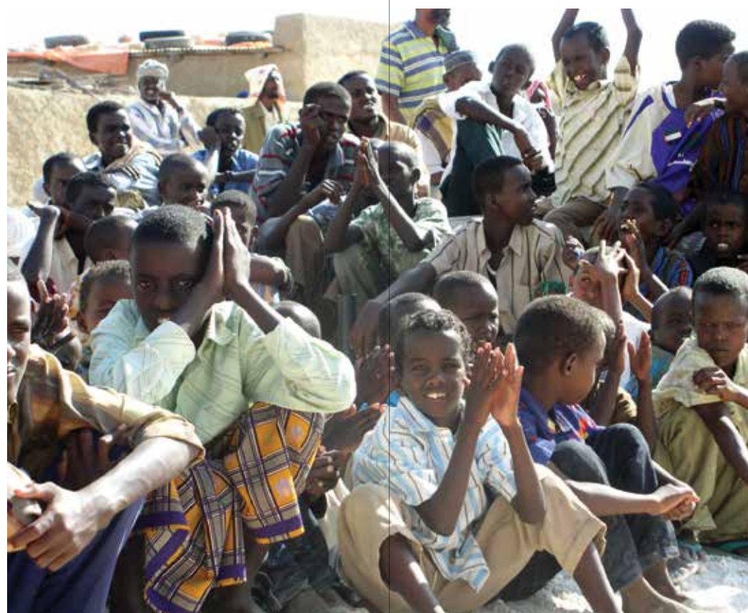
People all around the world see peace as essential to their well being. Young boys in Mogadishu, Somalia.