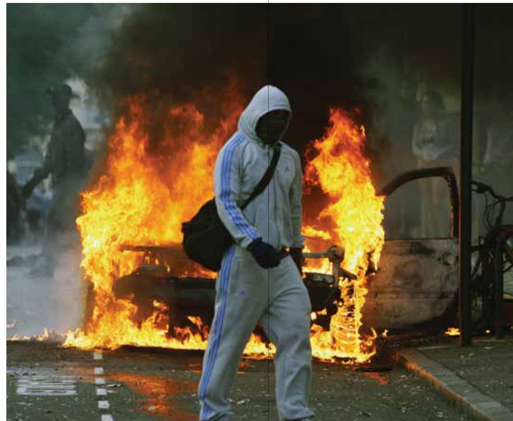
Vulnerability to violence is a universal issue: London suffers rioting and looting in August 2011.

While some countries have been seriously affected by armed conflict, people everywhere face insecurity in their lives. Any goal on peace, justice and governance should look beyond what some Member States refer to as “special situations” and ensure that freedom from fear is promoted in all countries.