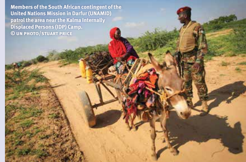
Members of the South African contingent of the United Nations Mission in Darfur (UNAMID) patrol the area near the Kalma Internally Displaced Persons (IDP) Camp. KEY AU African Union COP Conference of Parties EC European Commission ICESDF Intergovernmental Committee of Experts on Sustainable Development Financing OWG Open Working Group SDGs Sustainable Development Goals UNGA UN General Assembly UNPGA UN President of the General Assembly UNSG UN Secretary General

EC Communique: A Decent Life for All, February 2014 EU common position on the post-2015 development agenda proposed 17 priority areas, emphasising that the new framework should promote good governance, democracy and the rule of law and address peaceful societies and freedom from violence.