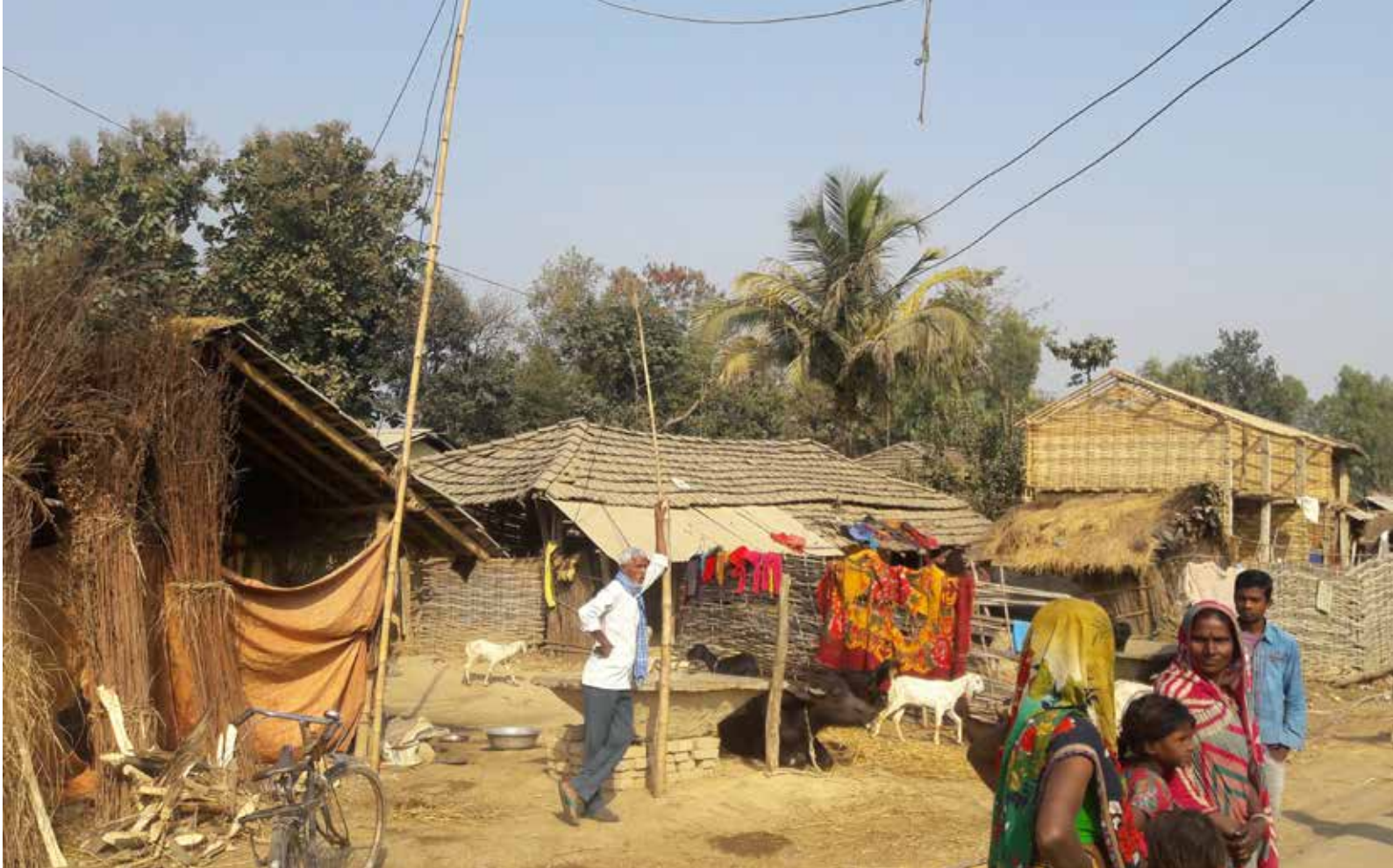
A Nepalese homestead in Tarai.

empowerment of free Kamaiya, 2 the transnational justice for the disappeared family members during the Maoist war, the restructuring of the provincial boundaries and other issues remain unaddressed.