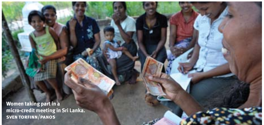
Women taking part in a micro-credit meeting in Sri Lanka.

Council Conclusions on Security and Development, 2007