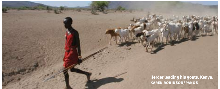
Herder leading his goats, Kenya.

Undertaking a ‘conflict analysis’ is key to developing a conflict-sensitive approach (see section: What is a conflict analysis? ).