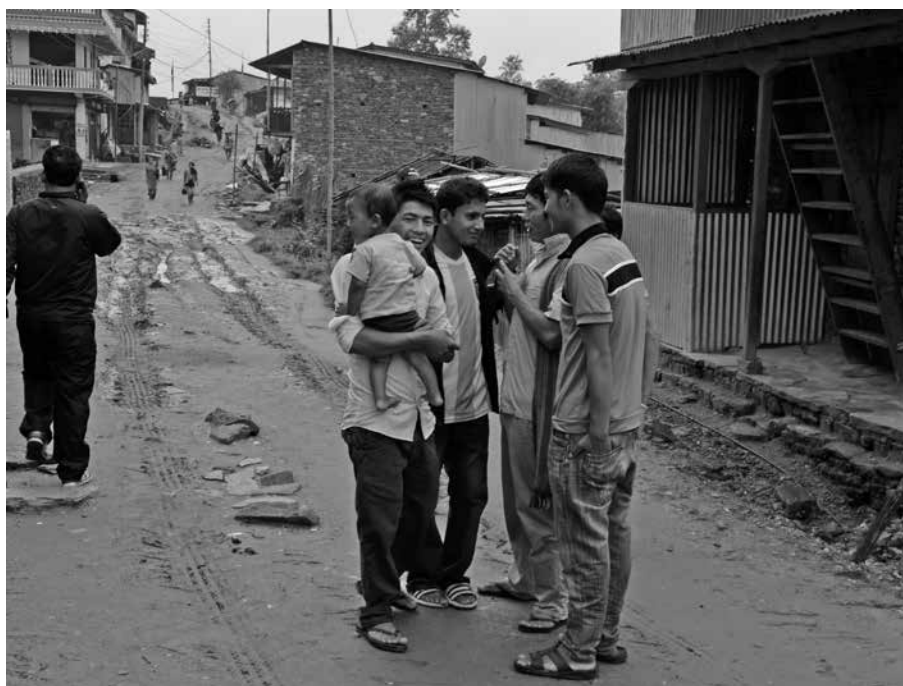
A local man from Sankhuwasabha holding his baby, while chatting with his male friends.