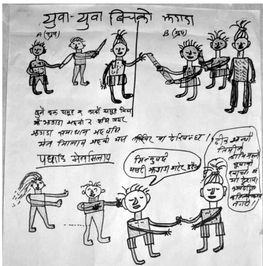
Participants' illustration of violent behaviour and non-violent solution.

Masculinities influence men's seeking help, 199 particularly around mental health problems, which has an important influence on men's self-inflicted violence and suicide. However, to date there seems to be little support for young men in such challenging emotional situations.