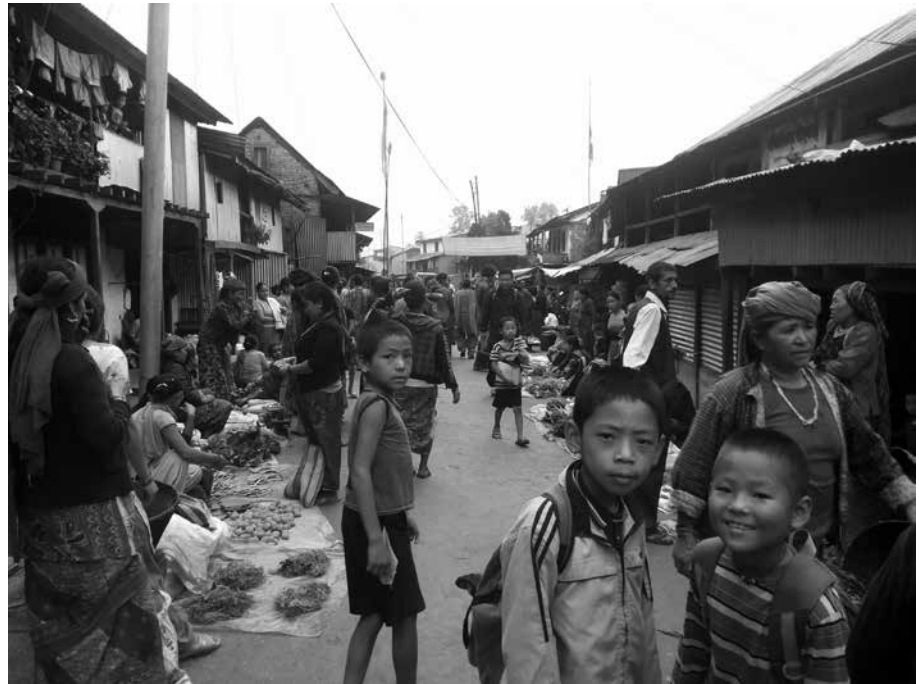
Local marketplace in Sankhuwasabha district.

Sunsari district is also located in the Kosi Zone, in the eastern Terai of Nepal, south from Sankhuwasabha district. The district covers 1,257 square kilometres 21 and is divided in northern and southern sections by the East-West highway. The population of Sunsari district is 625,633 of whom 315,530 are male and 310,103 are female. 22 The majority of people in Sunsari are Hindu (77.09%), with smaller populations of Muslims with smaller populations of Muslims (11.06%) and Kirat (6.73%). The composition of caste and ethnic groups in this location includes: Brahmin, Chhetri, Rai, Limbu, Musahar, Sarki, Damai, Newar, Gurung, Tamang, Tharu and Madheshi. During the field research, Saferworld partnered with the YDC. The research site in Sunsari, a VDC approximately 30 minutes' drive from Inaruwa, is relatively more urban and developed compared to Sankhuwasabha. It has better infrastructure and access to roads, electricity, schools and markets. The major source of revenue in Sunsari is agriculture. The main crops are rice, wheat, maize, sugar cane and jute. 23 An industrial corridor runs from Duhabi in the south of the district to Dharan in the north. The main industries here are jute, cooking oil, snack foods, soap, plastic, and construction materials.