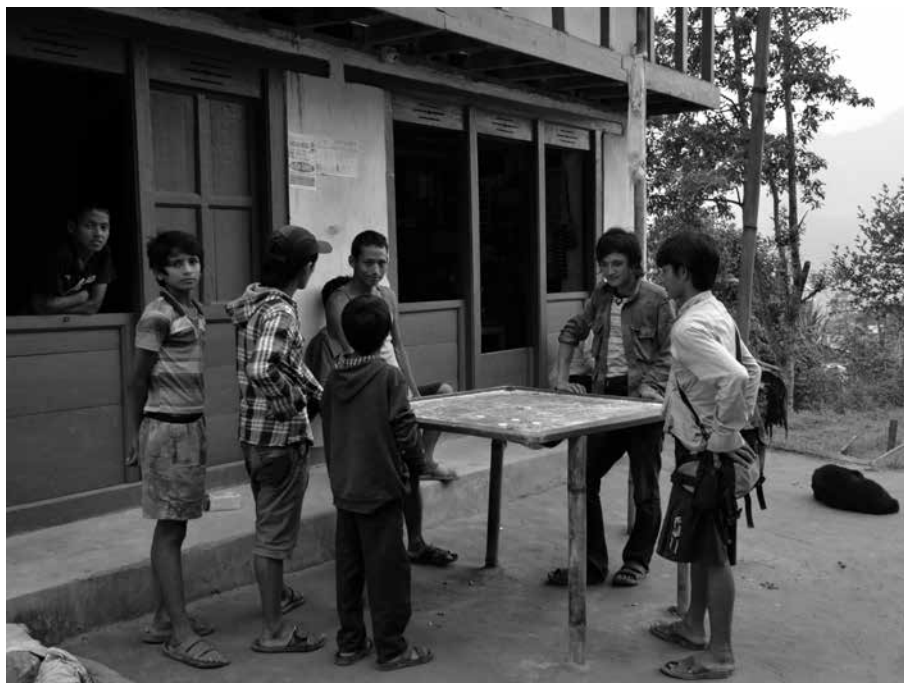
Boys playing carom board near the marketplace in Sankhuwasabha, one of their popular leisure activities.

Because, if you [young men and women] go out during the night time, it is related to prestige. The night does not belong to us, it belongs to others. We have to be careful in case our prestige gets a bad reputation because of young boys and girls going out at night. 42