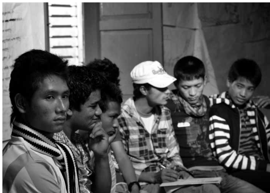
Local boys from Sankhuwasabha engaged in group activity.

This clearly indicates how the expectations for men are often thwarted by their reality. Young men are expected to be educated, but circumstances sometimes prevent them completing their studies. They are expected to be educated to get a good job, but the more urgent economic necessity of working prevents this. The trend of women becoming more educated may also have implications for men's opportunities in the job market and marriage. 75 The young men in our study are trying to navigate contradictory expectations and social and economic pressures, which mean that they are destined to fail in meeting at least one of these aspects of masculinity.