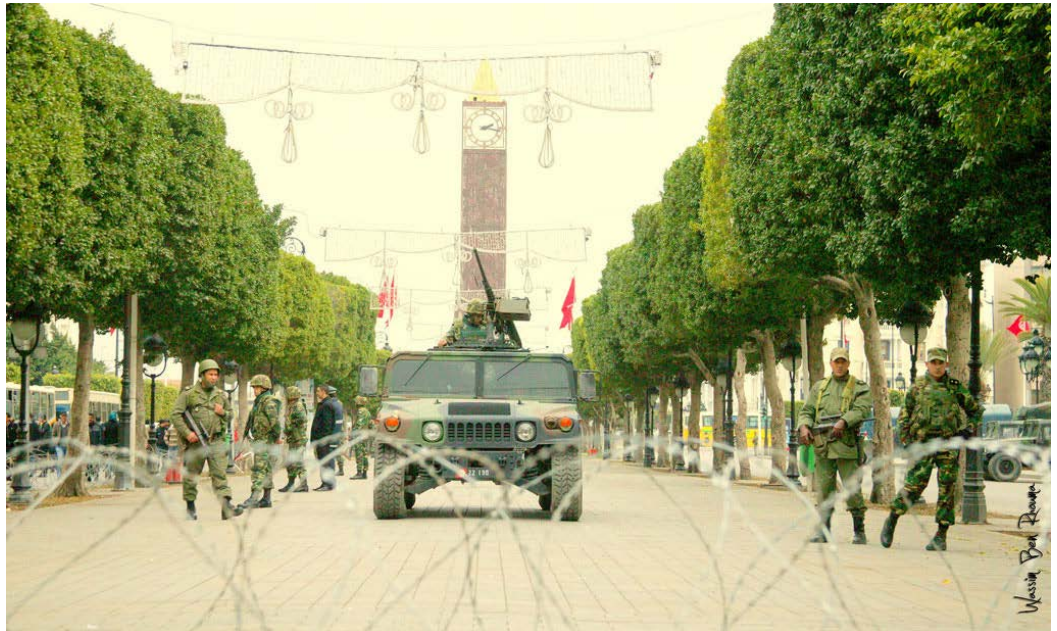
Military presence in the centre of Tunis.