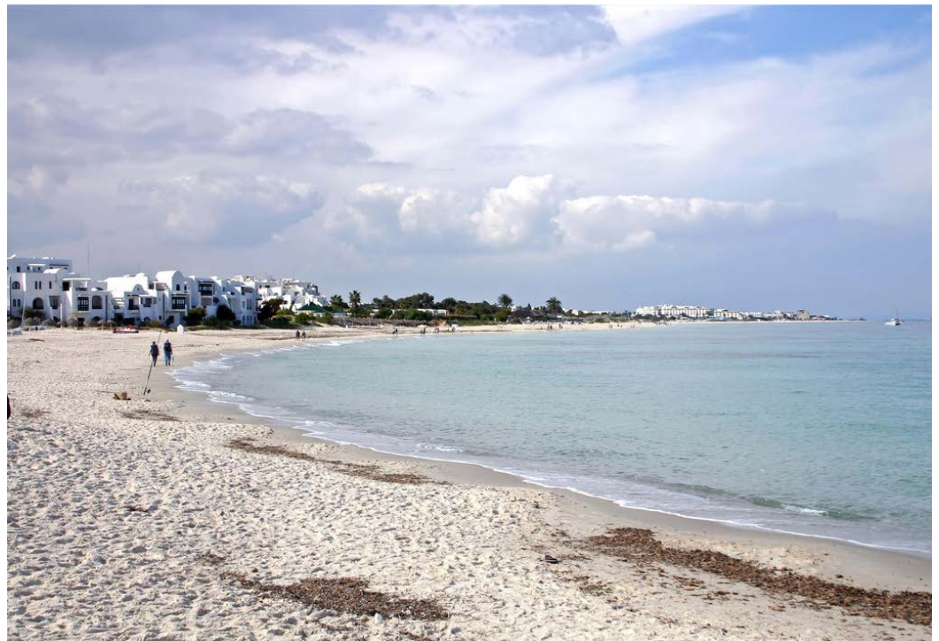
Port El Kantaoui Beach, Sousse.

Amid severe unemployment, the weakening of the tourism sector – which provided nearly 14 per cent of Tunisian jobs in 2014 [9] – has put many jobs at risk. Tourism had already slumped since the 2011 uprisings, but the Bardo museum and Sousse attacks were a hammer blow: 440,000 British tourists travelled to Tunisia every year before the Sousse attack; 90 per cent have since stopped coming. [10] Violent armed groups gained from this destabilisation, which notably increased the pool of people from which they could recruit: we were told that some of those who lost their jobs following the Sousse attack joined violent groups in search of an income. [11]