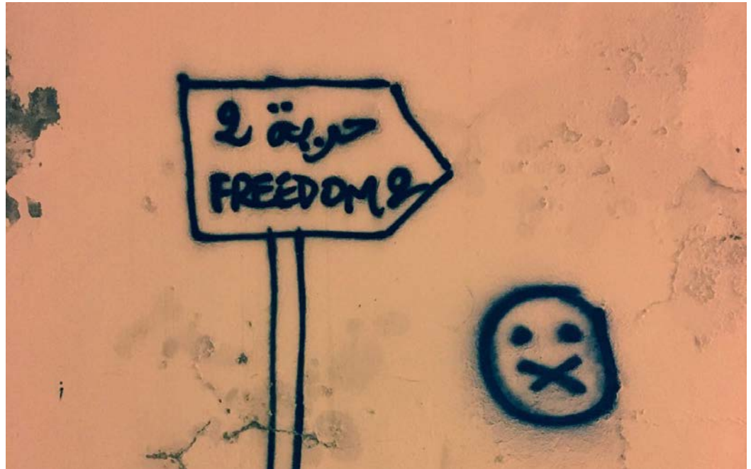
Graffiti in the Medina of Tunis says 'Freedom 2km away'. Following the uprisings, many Tunisians feel that freedom is still a long way off.

Not only have these practices had significant impacts on people's lives, by hampering access to employment, education, health, and in turn leaving many facing greater marginalisation and stigmatisation, they have also created a lot of anger and resentment toward the state and the police. A civil society representative in Tunis told us of a man arrested on terrorism charges whose family hadn't been informed of his detention. Before his release, his mother died of a heart attack, still believing he had gone to fight in Syria. "This clearly exacerbates anger toward security services," the interviewee explained. [86]