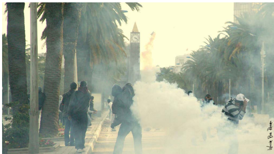
Demonstration in Tunis during the uprisings, January 2011.

These statements are illustrative of how violent groups have been successful in rooting their action in the Tunisian context, boosting their recruitment strategy by offering financial and material benefits to potential recruits. One young person told us: “I would be ready to join a terrorist group for money; I would even be ready to kill my father for money. That is why these groups recruit specifically among poor communities.” Another said: “if they [violent groups] offer you what you need, you can’t not obey them. You and your family will directly benefit from them.” [46] Money and other material benefits have not only been used to recruit active members but also informants among local people. [47]