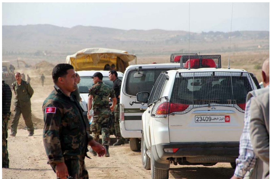
Tunisian security forces continue to pursue al-Qaeda linked terrorists in Jebel Chaambi.

One area where security measures have negatively impacted local populations has been border control. The Tunisian government has taken steps to address the threat posed by over 1,400km of porous borders. To the east, it has sought to militarise the border to prevent spill-over from the Libyan conflict and the incursion of violent groups. This has severely restricted informal cross-border trade – on which many people's livelihoods depend – and has resulted in confrontations between citizens and security services during tense protests. [97] Due to the economic paralysis and violence it causes, people we spoke to in Medenine actually identified border closure as a source of conflict and insecurity. [98] These concerns, along with the inability of the Tunisian government to provide alternative livelihood options and effectively regulate cross-border trade – due in part to the collusion between local security providers, politicians, businessmen and smuggling networks – have in turn granted violent groups leeway to exploit social anger in Tunisia's south. [99]