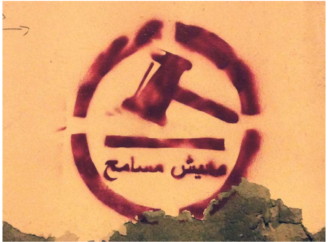
Graffiti of a gavel and block with the words 'I do not forgive', which is the name of a movement set up to protest against the economic reconciliation law.

In May 2017, the founder and director of the Tunisian news website Nawaat was harassed and questioned for six hours about an article that leaked details of the bill. As Amnesty International noted, the incident "sends a worrying signal that the Tunisian authorities are willing to clamp down on the right to freedom of expression." [68]